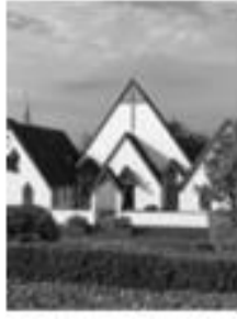
St. Joseph's Raglan Road Devonport PL1 4NQ

Part of the Plymouth Roman Catholic Diocesan Trust - Registered Charity No. 213227