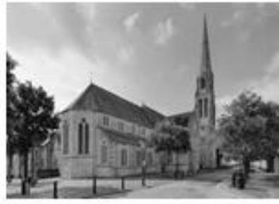
Cathedral 45 Cecil Street Stonehouse PL1 5HW