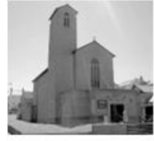
Christ the King Armada Way PL1 2EN