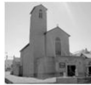
Christ the King Armada Way PL1 2EN