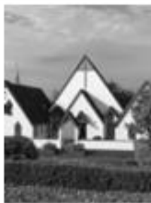
St. Joseph's Raglan Road Devonport PL1 4NQ

Part of the Plymouth Roman Catholic Diocesan Trust - Registered Charity No. 213227