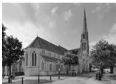
Cathedral 45 Cecil Street Stonehouse PL1 5HW